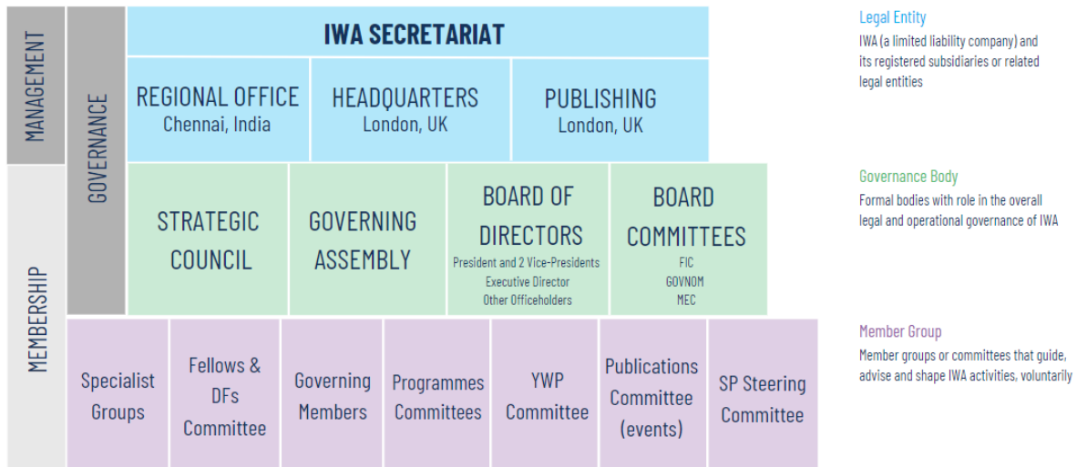
FIGURE 1: IWA structure with formally recognised IWA leadership (IWA members groups).

Figure 1 represents the IWA Structure with formally recognised IWA Leadership.