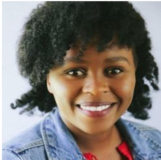
Beth Koigi Majik Water