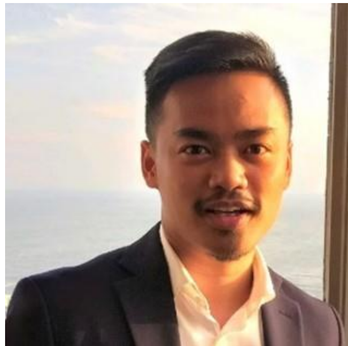
Yang Villa IWA & Grundfos Youth Fellow