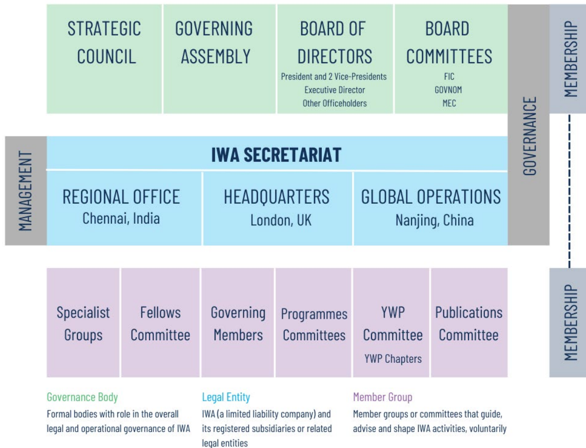
FIGURE 1: IWA structure with formally recognised IWA leadership (IWA members groups).

Figure 1 represents the IWA Structure with formally recognised IWA Leadership.