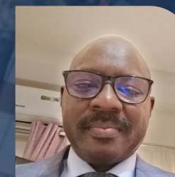
IBRA SOW PAN-AFRICAN ASSOCIATION OF SANITATION ACTORS