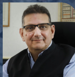
HITESH VAIDYA NATIONAL INSTITUTE OF URBAN AFFAIRS, INDIA