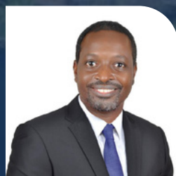
ALLAN NKURUNZIZA CABINET EDE INTERNATIONAL