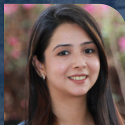
ADITI DWIVEDI CENTER FOR WATER AND SANITATION, CEPT UNIVERSITY